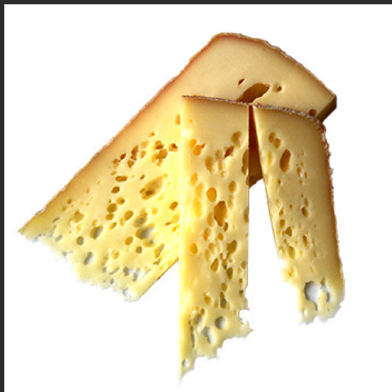
Braehead Foods Code: 12213

A semi hard, washed rind cheese. Fat Cow has a strong meaty aroma with a delicate sweet flavour and smooth texture.