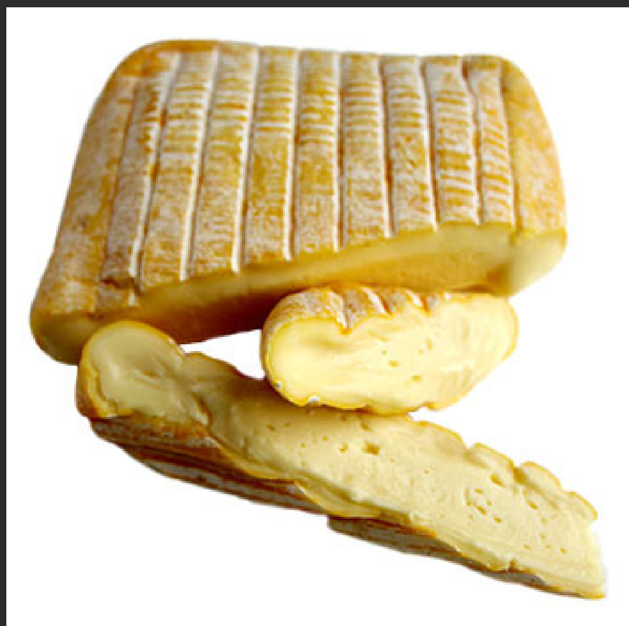
Braehead Foods Code: 12214

Cheese making by the Stone family since the 1950's,